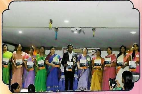
Journal Released by M.A.HRM