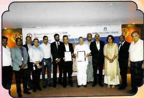
MOU-Signed with TCS