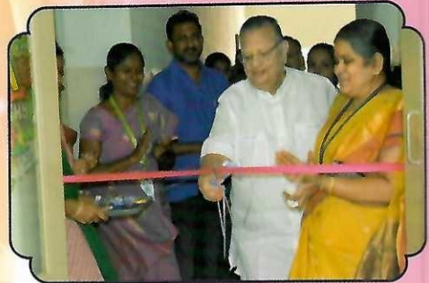
Apollo Shine Inauguration