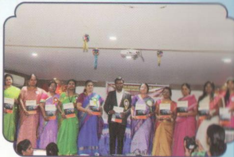
Journal Released by M.A.HRM