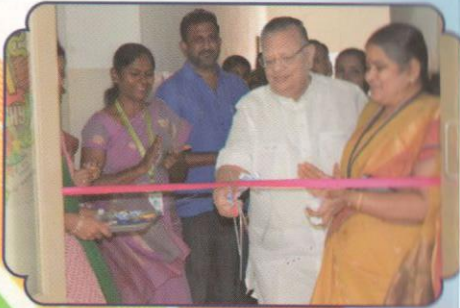
Apollo Shine Inauguration