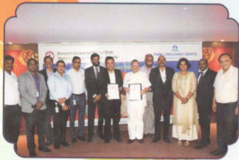
MOU-Signed with TCS