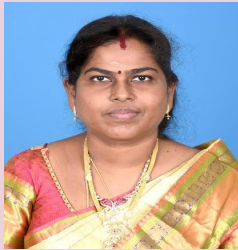
DEAN OF STUDENT AFFAIRS(UG)