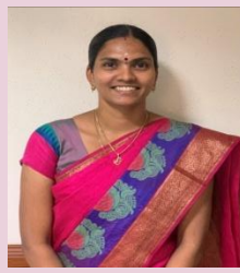
DEAN OF STUDENT AFFAIRS(PG)