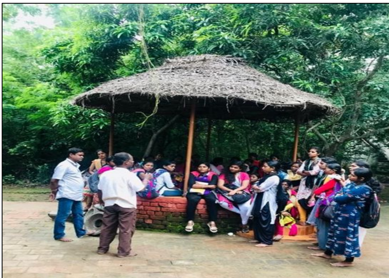
Briefing the formulation of Herbal Medicine