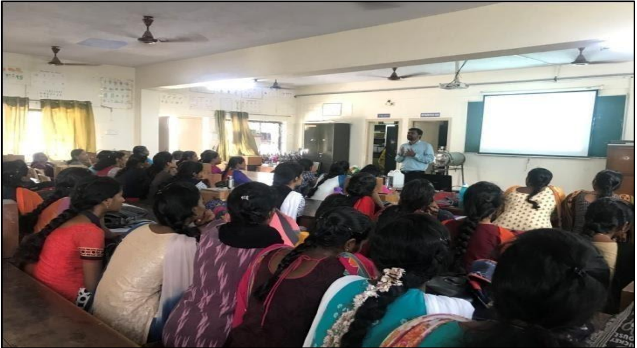
Demo on Spirulina cultivation

A hands-on training programme on “Spirulina Cultivation and Seaweed liquid fertilizer” was conducted on 21st January 2020. Students were taught about Spirulina cultivation, Phycocyanin extraction from Spirulina, Seed weed biofertilizer preparation and Sodium alginate gel preparation from sea weeds.