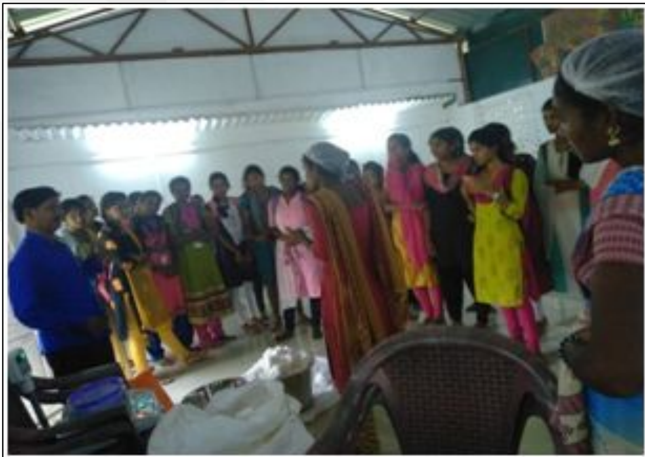
Processing of cotton and preparing sanitary napkins