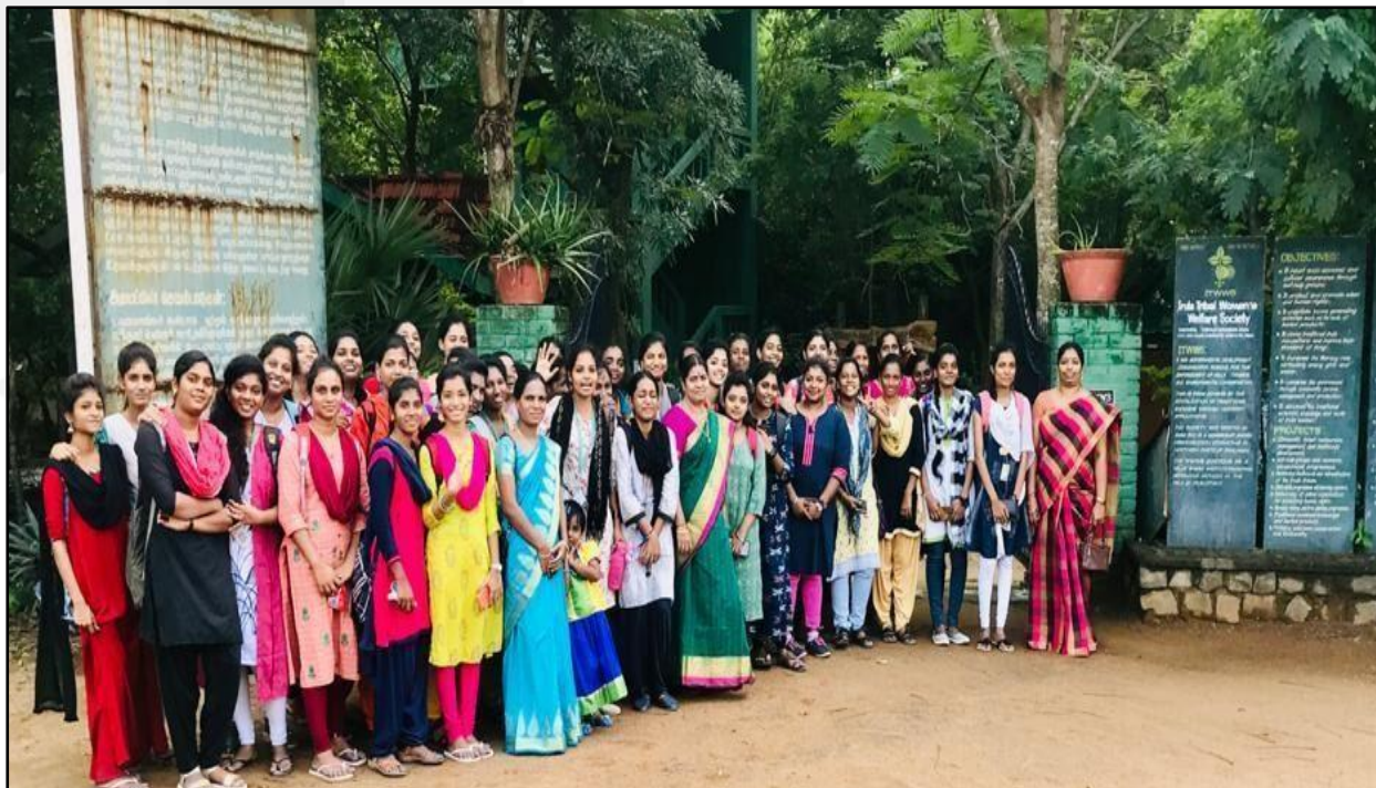
Entrance of Irula Tribal Women's Welfare Society

An awareness programme on “Medicinal herbs” was conducted on 17th December 2019, during which the staff and the students visited “Irula Tribal Women's Welfare Society (ITWWS), Thandarai Village, Thirukalukundram Road which is maintained by Irula tribal women.