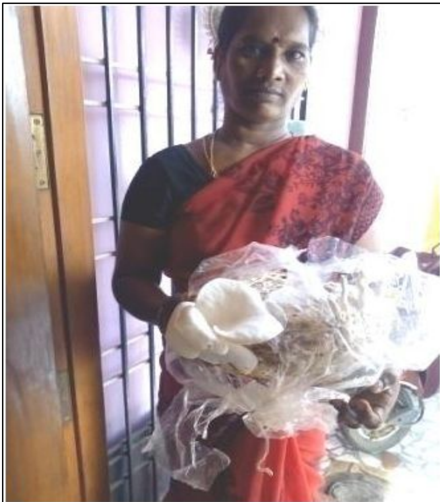
Mature Oyster Mushroom cultivated by the trainee women after 18 days of incubation