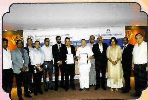
MOU-Signed with TCS