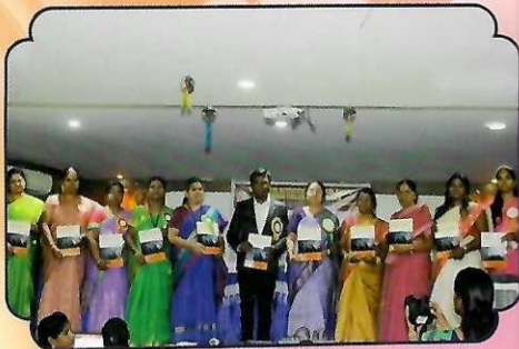
Journal Released by M.A.HRM