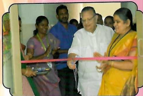
Apollo Shine Inauguration