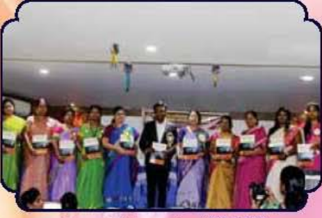
Journal Released by M.A.HRM